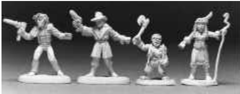
20-500 Shadowrunners. Normally $6.50, now only $5.85.

When ordering by phone, please remember to tell the operator you are ordering items featured in this ad in the Shadowrun Supplemental in order to receive the special discount price. These prices are available only through this special offer in The Shadowrun Supplemental.