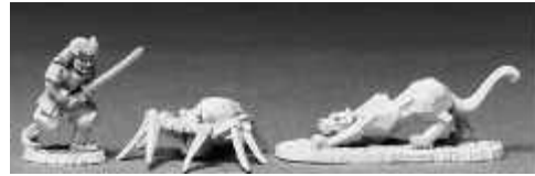
20-528 Black Ice Icons. Normally $5.50, now only $4.95.