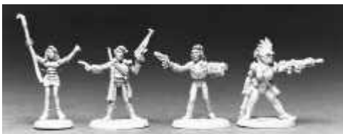
20-525 Strike Force Bravo. Normally $6.50, now only $5.85