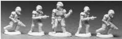
20-510 Corporate Security Guards. Normally $8.00, now only $7.20.