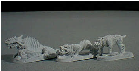
20-514 Corporate Guard Animals. Normally $6.25, now only $5.65.