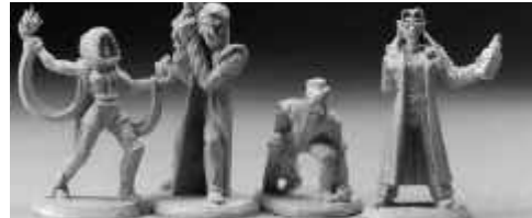
20-550 Assassins. Normally $6.75, now only $6.00.