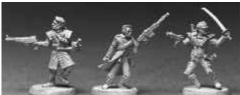
20-502 Human Street Samurai. Normally $5.50, now only $4.95.